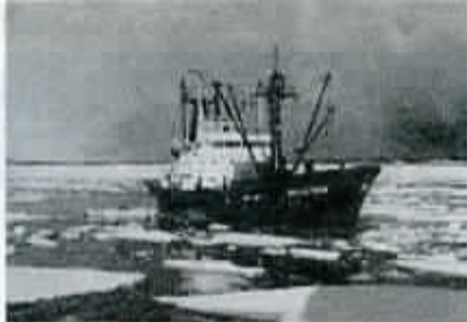
The Antarctic resupply vessel, Neila Dan anchored off the Vestfold Hills, near Davis Station.